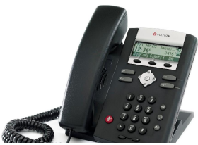
Polycom SoundPoint IP 331