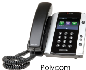
Polycom VVX 500