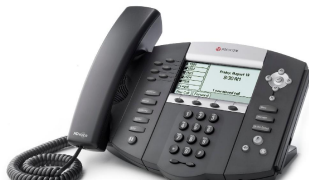
Polycom SoundPoint IP 550 & IP 650