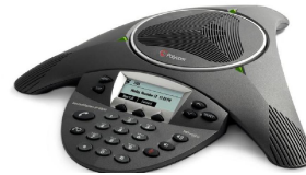
Polycom SoundStation IP 6000