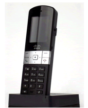
Cisco SPA 302 Cordless