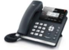
Yealink T4 series